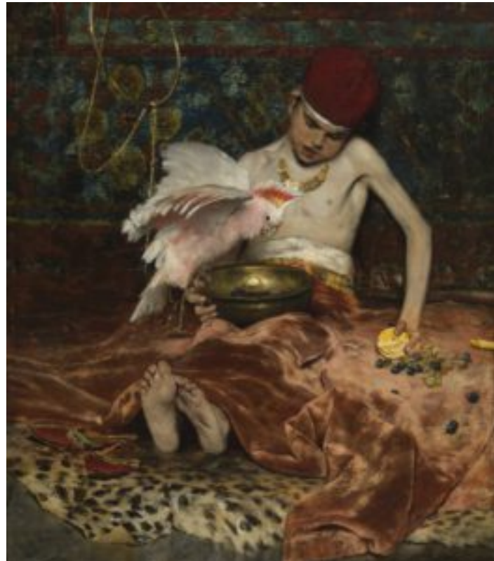
Fig. 1. William Merritt Chase, The Turkish Page (The Unexpected Intrusion), 1876. Oil on canvas, 48 ½ x 37 1/8 in. Cincinnati Art Museum. Gift of the John Levy Galleries

In the course of researching my dissertation “Animal Pursuits: Hunting and the Visual Arts in Nineteenth-Century America,” I have often had occasion to consider (and sometimes lament) the unequal relationships between humans and animals that are frequently pictured in art. I have found taxidermy to be a potent material embodiment of this power dynamic that somewhat surprisingly connects a wide variety of nineteenth-century visual history, encompassing the work of Charles Willson Peale (1741–1827), Victorian home furnishings, academic painting, and other visual realms. While the presence of taxidermy in nineteenth-century life is well documented, it has been more challenging to trace its intersection with the fine arts. References to artists such as