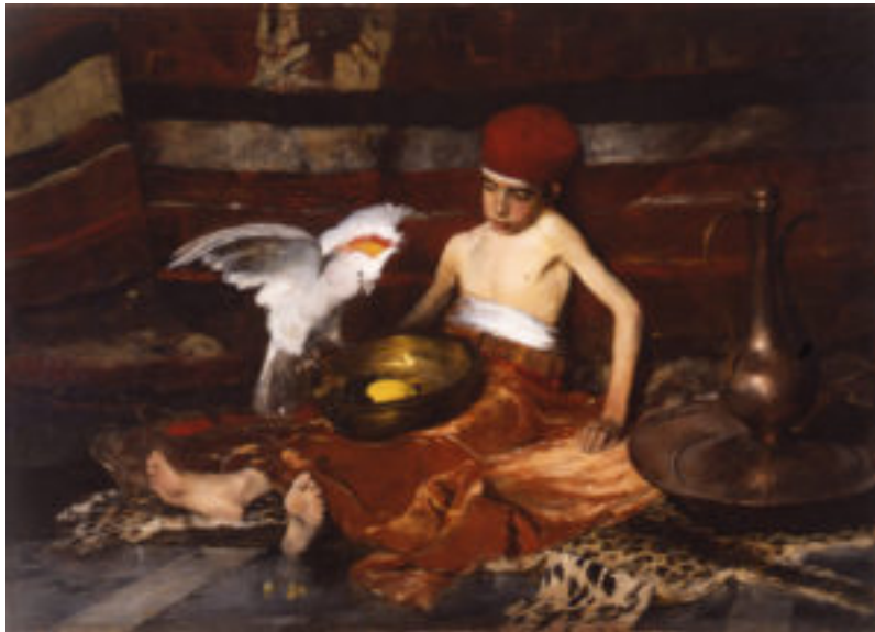
Fig. 2. Frank Duveneck, Turkish Page , 1876. Oil on canvas, 42 x 58 ¼ in. Courtesy of the Pennsylvania Academy of the Fine Arts, Philadelphia. Joseph E. Temple Fund.

Gustave Courbet (1819–1877) who employed taxidermy in the studio are scattered throughout the literature on nineteenth-century art, but relatively little material or documentary record of the practice remains. 1 I was thrilled, however, to find a piece of visual evidence hiding in plain sight within a photograph of the studio of William Merritt Chase (1849–1916) at the Archives of American Art that allowed for the concrete determination of an artist's use of a taxidermy model in the construction of a painting. While this might at first seem a minor discovery regarding the history of a single painting, it opens up intriguing avenues of inquiry into issues of nineteenth-century studio practice, animal representation, and the ways in which art served to negotiate the relationship between humans and other species, which constitute the essay that follows.