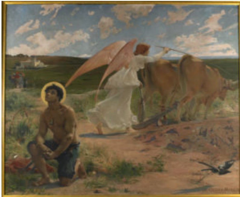
Fig. 6. Luc Olivier Merson, St. Isidore the Plowman , 1878. Oil on canvas, 250 x 301 cm. Musée des Beaux-Arts, Rouen.

magpie that appears in the lower right of Merson's St. Isidore the Plowman flying rightward out of the composition (fig. 6). The bird appears practically identical in pose and coloring to the stuffed magpie seen hanging in his studio in the later photograph. Although taxidermy specimens commonly inhabited the studio space, their status as aids in the production of art was rarely acknowledged or discussed. At a moment when artists were engaged in examining the interplay between the real and the imagined by calling attention to the use of mannequins and lay-figures, animals were almost always presented as straightforward depictions of living creatures. For many painters, it would seem the stark existential differences between a taxidermied animal, frozen forever in a single pose, and a living, sentient creature was of little consequence.