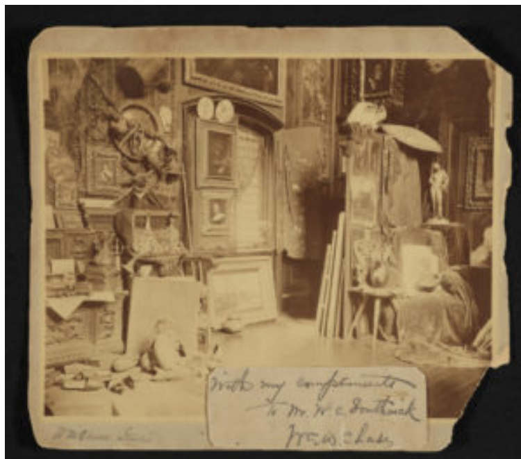
Fig. 3. Unidentified Photographer (Possibly George Collins Cox), William Merritt Chase’s 10th Street Studio in New York , ca 1880. Photographic print on board. 23 x 26 cm. Miscellaneous photographs collection. Archives of American Art, Smithsonian Institution.

Despite Chase and Duveneck’s seeming disregard of the cockatoo’s sentience, the taxidermied animals that often appear in nineteenth-century paintings were never simply artists’ props or studio paraphernalia—mere inanimate objects—but were instead exanimate subjects, which when closely examined extend the discourse of nineteenth-century subjectivity in two of the key mediums of the period: animal and artist. Stripped of their agency prior to entering the studio, these animals were reanimated by the hand of the artist into fully formed subjects upon the canvas. On the one hand, taxidermy presented a technological solution to the problem of working with unpredictable creatures as models. However, the complete removal of animals from the act of their own representation through the killing, stuffing, and mounting of formerly living beings as taxidermy models, must also be considered as part of the larger process by which industrialization and urbanization divorced humans both physically and culturally from other animals. While animal subjects were traditionally held in low esteem within academic hierarchies (as well as art historical scholarship), a more thorough interrogation of the material processes of animal representation yields new insights into the ways in which images worked more broadly to structure the imperious relationship humans have to the natural world.