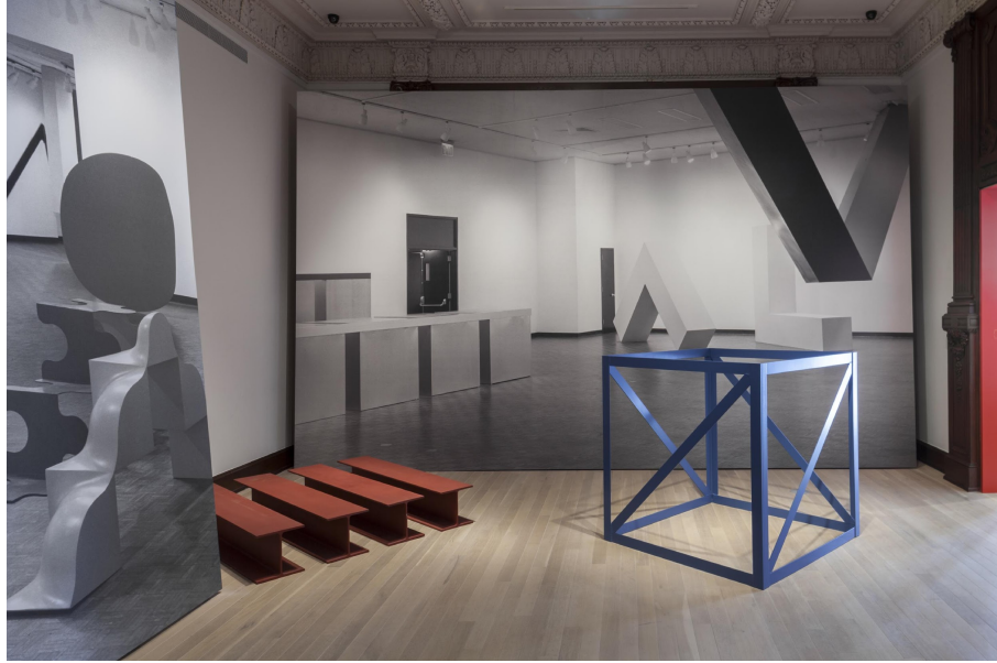
Fig. 1. Installation view of Other Primary Structures at The Jewish Museum, New York, March 14–May 18, 2014. Foreground: Rasheed Araeen, Sculpture No. 1 , 1965, and First Structure , 1966–67; background: archival photographs from Primary Structures , 1966, including Ellsworth Kelly, Blue Disc , 1963, on the far left.

Four recent exhibitions reveal geography to be a common concern in twenty-first century Kelly scholarship. The varied treatment of the artist in these exhibitions, however, also indicates that much remains to be determined about his work and its place in our histories of postwar art. In the 2014 Jewish Museum exhibition Other Primary Structures , a wall-sized black and white archival photograph featuring Kelly's 1963 relief Blue Disc served as a backdrop to Pakistani-English artist and theorist Rasheed Araeen's steel construction First Structure , 1966–67, in the vivacity of its own painted blue surface (fig. 1). Our new histories of postwar art, this juxtaposition implies, will have to replace the canonical American artists represented in the 1966 Jewish Museum exhibition Primary Structures with their "other," formerly marginalized historical peers from Africa, Asia, Eastern and East-Central Europe, Latin America, and the Middle East. A year later, the Museum of Modern Art's own revisionist postwar art exhibition, Transmissions: Art in Eastern Europe and Latin America ,