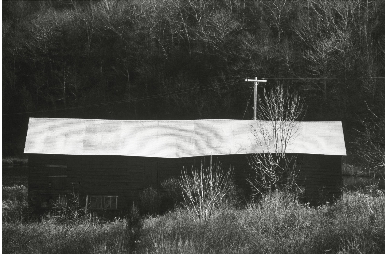
Fig. 3. Ellsworth Kelly, Barn, Taconic , 1974, Gelatin silver print, 8 1/2 x 12 7/8 in. (22 x 33 cm). © Ellsworth Kelly,