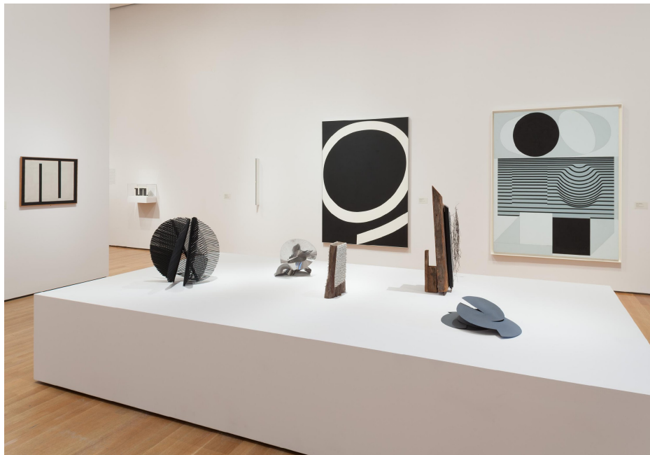
Fig. 2. Installation view of Transmissions: Art in Eastern Europe and Latin America, 1960–1980 , The Museum of Modern Art, New York, September 5, 2015–January 3, 2016. Far wall: Julije Knifer and Gorgona Artists Group, Gorgona No. 2 , 1961; Willys de Castro, Active Object , 1961; Ellsworth Kelly, Running White , 1959; Victor Vasarely, Ondbo , 1956–60.

1960–1980, opened with a gallery devoted to work by artists who participated in the 1961 exhibition Art Abstrait Constructif International at Galerie Denise René in Paris. There, Kelly’s painting Running White , 1959, was the sole work by an American-born artist. 1 Its immediate neighbor to the left was Active Object , 1961, by Brazilian Neo-Concretist Willys de Castro (fig. 2); another of de Castro’s Active Objects , this one dated 1960, directly faced the installation shot of Kelly’s Blue Disc in Other Primary Structures .