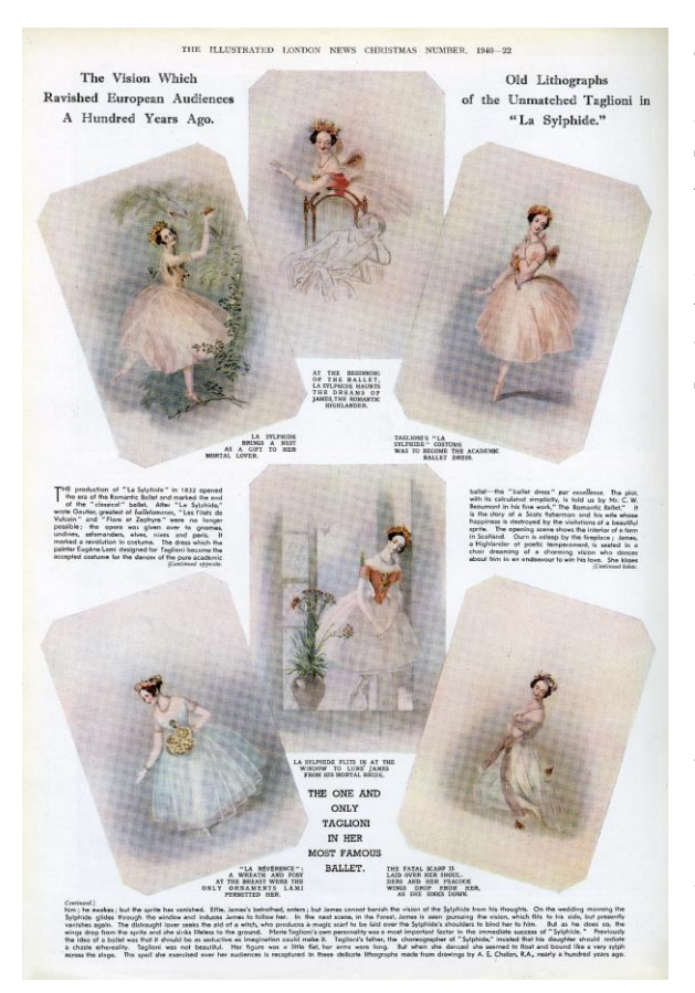
Fig. 5. Page from The Illustrated London News, Christmas Number , 1941–22, the same page owned by Joseph Cornell. Box 26, Folder 2, Joseph Cornell Papers, 1804–1896, bulk 1939–1972, Archives of American Art, Smithsonian Institution.

June 1945.<sup>20</sup> A few issues of Dance survive in Cornell's library and archives, including one from July 1945.<sup>21</sup> Cornell expertly intertwines Taglioni and Moore, ballet women dedicated to bringing the past of the art to the present, connecting Cornell, as audience-artist, to performers in the nineteenth century and beyond. As was typical for him, he coalesces his referents. The Sylphide is Taglioni and Taglioni is the Sylphide, and perhaps all other dancers who performed her role are, too.