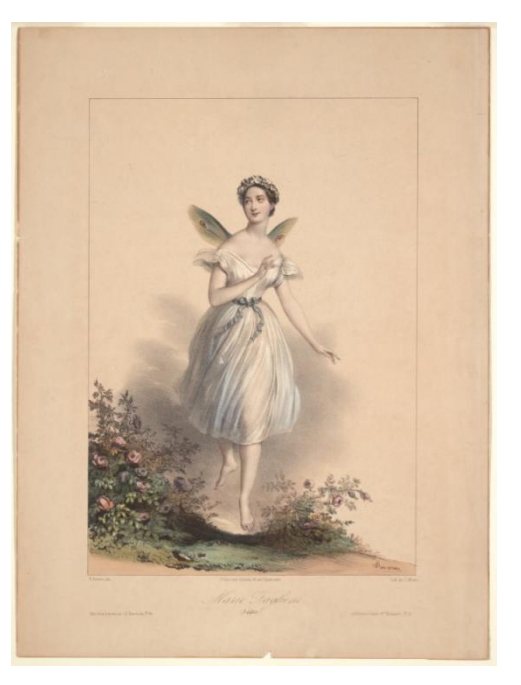
Fig. 4. Charles Etienne Pierre Motte, after Achille Devéria, Marie Taglioni (Sylphide) , c. 1830–39. Colored lithograph, 133/4x91/2 inches. Jerome Robbins Dance Division, The New York Public Library for the Performing Arts.

The 1949 reliquary memorializes a dying kind of narrative ballet through a particular figure, the tragic Sylphide. Since Cornell does not include an article— "La" or "Les"—the box can refer to both to the 1832 Romantic ballet La Sylphide , made famous by Marie Taglioni, and the 1907 ballet blanc Les Sylphides , choreographed by Mikhail Fokine. The foundational 1832 Romantic ballet was often illustrated in the prized lithographs which Cornell and other balletomanes collected (fig. 4).<sup>18</sup> In some lithographs of Taglioni, the ballerina wears the flowing, anklerevealing tutu that she popularized, with a blue ribbon emphasizing her waist.<sup>19</sup> Moore would have immediately thought of the earlier dancer; she translated Taglioni's letters for the magazine Dance in