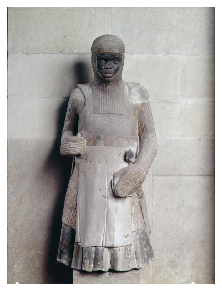
Fig.3. Statue of St. Maurice, c. 1240–50. Sandstone, 43 11/16 in. high (fragment). Magdeburg Cathedral of St. Maurice and St. Catherine, choir, Magdeburg, Germany.

The best-known monument to St. Maurice rendered as a person of African descent is the eponymous statue of a chain mail-wearing knight (c. 1240–50) installed in the choir of the Cathedral of St. Maurice and St. Catherine of Alexandria in Magdeburg, Germany (fig. 3). More than twice as tall as Mauritius . the Magdeburg Maurice is 43 11/16 inches in height. Over the centuries, it has suffered noticeable losses: its sandstone medium is abraded; paint has worn away in many places; portions of the nose have been chipped off; and absent are the legs on which the figure once stood, as well as the object implement it once held in its right hand. In a reduced state, the Magdeburg figure is drawn into an interesting conversation with Bearden's Mauritius, which is a stark collection of juxtaposed elements.