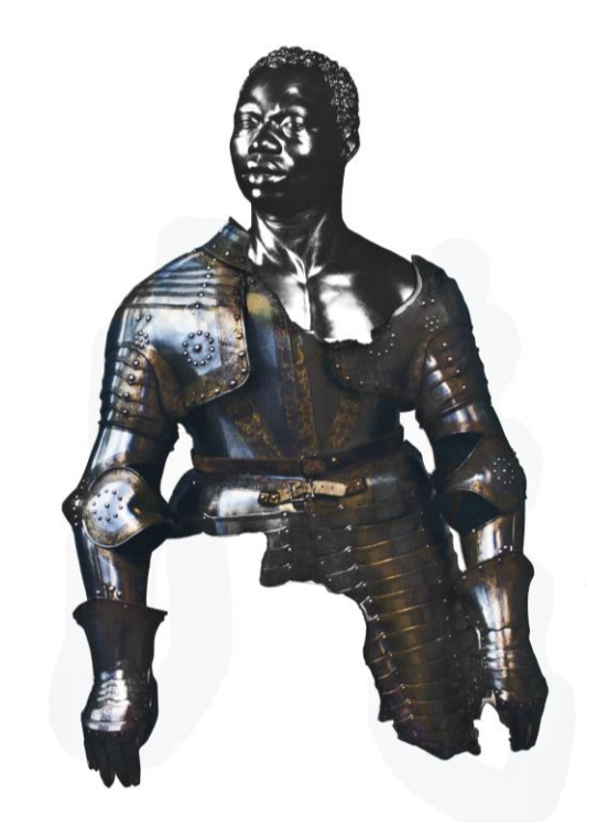
Fig. 4. Stan Squirewell, Maurice the Saint , 2017. Scorched pigment print, 14 \ge 20 in.

Contemporary artist Stan Squirewell (b. 1978), in his own words, "looks for images of blackness everywhere in the world."30 He photographs exhibited objects and pictures that he encounters during his visits to museums across the world and subsequently reorganizes these discrete parts into collages. As Bearden was, Squirewell was inspired by the legend of St. Maurice. Squirewell's Maurice the Saint is a photo of Francis Harwood's recognizable Bust of a Man (1758; The J. Paul Getty Museum), a black stone sculpture. In Squirewell's composition, the figure's head is seen in threequarter profile and its left shoulder is exposed; sturdy medieval armor covers only part of the man's trunk. Not only is the armored suit incomplete, but so is the warrior's body below the beltline. Yet this muscular warrior is not entirely vulnerable. He is a formidable relic of past representation with relevance for the present, resurrected by Squirewell, interested as he is in presenting a virtuous and inspiring black masculinity.