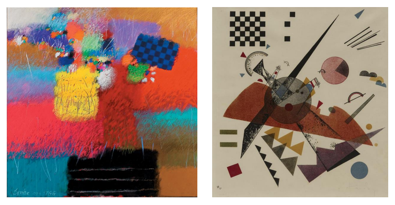
Figs. 4, 5. Left: Moe Brooker, Ancient Futures , 2006. Mixed media on wood panel, 48 x 48 in. Courtesy of June Kelly Gallery © 2006 Moe A. Brooker; Right: Wassily Kandinsky, Orange-Composition with Chessboard , 1923. Color lithograph, 17 3/8 \times 16 in. Dallas Museum of Art, gift of the Carl Schurz Memorial Foundation of Philadelphia, 1936.2

revealed that by mid-career onward, "the artist seems to have favored far more complex mixtures of oil, resins, and his own tempera formulations."<sup>12</sup>