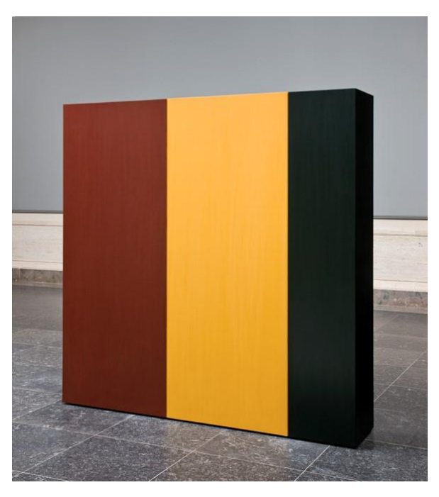
Fig. 2. Anne Truitt, Knight's Heritage , 1963. Acrylic on wood, 60 % x 60 % x 12 in. Collection of the National Gallery of Art, Washington, DC; photograph courtesy of National Gallery of Art, Washington, DC.

For Truitt, the organic and living are paramount, despite a lack of representational content. She seeks an atmosphere of "aliveness," so colors "won't settle."<sup>12</sup>