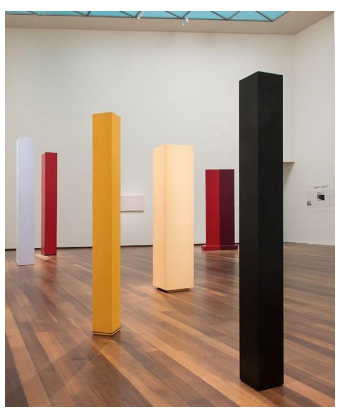
Fig. 1. Installation view, main gallery of In the Tower: Anne Truitt , National Gallery of Art, Washington, DC; photograph courtesy of National Gallery of Art, Washington, DC

Reviewed by: Mark L. Hanin, Art Writer and Law Clerk, Court of Appeals for the District of Columbia Circuit, Washington, DC