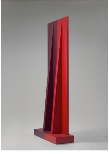
Figs. 4, 5. Left: Anne Truitt, Spume, Mid Day, Mary's Light, Sand Morning (canvas), Insurrection (left to right); photograph courtesy of National Gallery of Art, Washington, DC. Right: Anne Truitt, Insurrection , 1962. Acrylic on wood, 100 \frac{1}{2} x 42 x 16 in. Collection of the National Gallery of Art, Washington, DC; photograph courtesy of National Gallery of Art, Washington, DC

The exhibition also points to the limits of Anna Chave's influential critique of Minimalism as masculine and domineering by virtue of its form, materials, manufacturing techniques, and presentational modes. <sup>14</sup> Truitt's approach contrasts sharply with the outsourced production methods that symbolize an emptying out of individuality, emotion, and referentiality. Given the meticulousness with which she chiseled and sanded wood and then mixed, applied, layered, removed, and reapplied colors, she likely saw such aims as antithetical to her craft. She seemed intent on preserving an ineliminable imprint of individuality and personality despite opting for universalizing aesthetic language. This aspiration, which goes against the