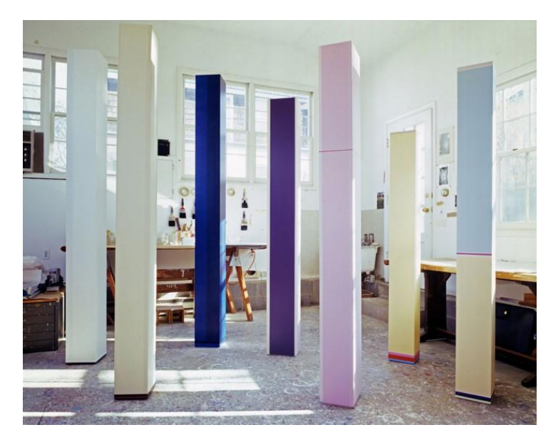
Fig. 6. Anne Truitt's 35th Street Studio in 1979.

Truitt is preoccupied with how color and form interact to create a dynamic lifting effect. To achieve it, Truitt often uses narrow bands of contrasting colors that wrap around a figure near its top or bottom (fig. 6). In architectural terms, these bands of color are ornaments rather than dispensable decorations, <sup>16</sup> playing an integral role to Truitt's method. Mid Day (1972; NGA) offers the best example. At its base, two adjoining bands of black and light brown give the bright red sculpture an electric charge so that the red hue, evoking the intensity of the noon sun, bolts toward the sky to a height of ten feet. A related effect in different tonalities characterizes Summer Remembered . A zigzagging dark blue band encircles the thin yellowish sculpture, vaulting it upward. The most elusive ornament appears in Twining Court II (2002; John and Mary Pappajohn Collection), a slender, austere black sculpture. A quarter-inch from the top, a thin black protrusion encircles the work. It is visible only at close range, and its meaning and function are difficult to divine.