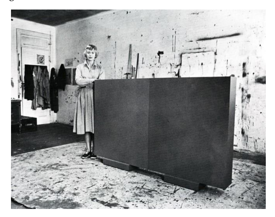
Fig. 8. Anne Truitt in Twining Court Studio (1962).

Truitt's deceptively plain sculptures invite us to do the hard work of really seeing, a much-needed skill in today's distraction-prone culture. In her art we confront alien, magnetic, self-sustaining objects (fig. 8). While they are refined aesthetic works, they refer us back to elemental processes in nature via the interplay of movement, light, and emotional vibrancy. The exhibition makes a case against reductive narratives of Minimalism and convincingly demonstrates how the organic and the individual can be preserved, improbably and subtly, in Minimalist garb.<sup>18</sup>