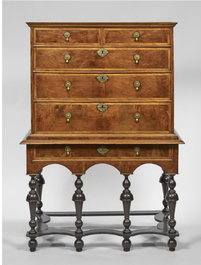
Fig. 1. High chest of drawers, Boston, 1700–10. Black walnut, aspen, white pine; 58 3 / 8 x 41 1 / 8 x 23 7 / 16 in. Yale University Art Gallery; Mabel Brady Garvan Collection (1930.2148)