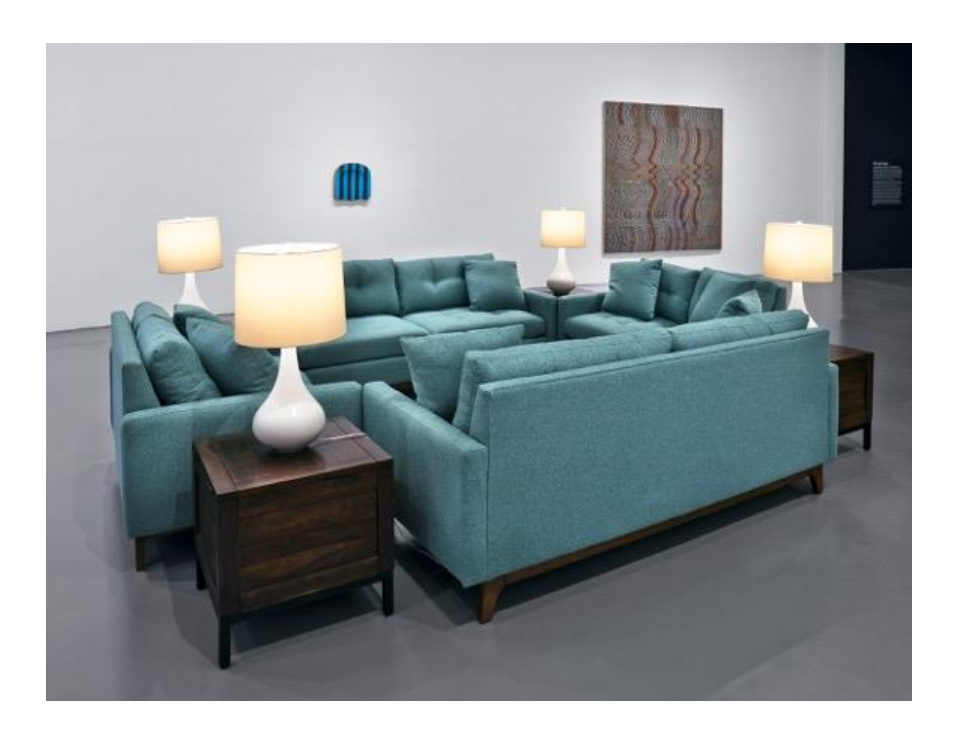
Fig. 4. Installation view of Brand New: Art and Commodity in the 1980s at the Hirshhorn Museum and Sculpture Garden, Smithsonian Institution, 2018. Left to right: Ken Lum, Untitled Furniture Sculpture, 1980; Sherrie Levine, Chair Seat: 5, 1986; Philip Taaffe, Undercurrent, 1984.

Erases History (1983; courtesy of the artist and Magenta Plains), Sherrie Levine's Chair Seat 5 (1986; courtesy of the artist and David Zwirner), and Philip Taaffe's Undercurrent (1984; collection of the artist) into over-the-couch art (fig. 4). This installation plan rewards close looking as it evacuates the surrounding paintings of their cool conceptualism. By emphasizing the decorative banality of these works, the move also strangely animates these paintings anew.