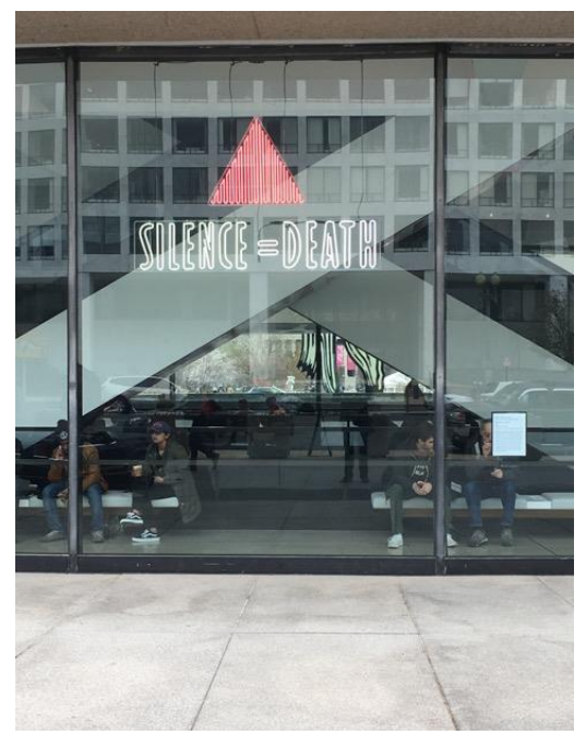
Fig. 3. Installation of ACT UP (Gran Fury), Silence = Death, 1987, in Brand New: Art and Commodity in the 1980s at the Hirshhorn Museum and Sculpture Garden, Smithsonian Institution, 2018.

Also unclear is the gallery organized around a theme of "Political Activism." The gallery contains Erika Rothenberg's Freedom of Expression Drugs (1989), a display of packaged products such as Protest Pills and Anti-Apathy Ointment, and Krysztof Wodiczko's Homeless Vehicle, Variant 5 (1988–89), a mobile shelter providing security and autonomy for its users in order. As works responsive to the insidious effects of corporate takeovers of both space and citizenship, these works are comfortably paired. Without its optional pendant painting, Sherrie Levine's Ignatz: 6 (1988) offers an opaque comment. Wall text elliptically explains that the painted Krazy Kat figure, depicted as having just thrown a brick, "both inspires and houses social desires and hopes" and "encapsulates the tragicomedy of our relationships with objects." Does Jetzer intend for audiences to puzzle over this work, a sign of violence without weapons, as an attack without argument? Is it a comment on protest in a world saturated by commodities? Are we meant to read this as illuminating or tamping down the influence of the works not only surrounding but preceding it? After exiting a gallery papered in Donald Moffett's He Kills Me (1987; International Center of Photography) and Gretchen Bender's continuously broadcasting Untitled (People with AIDS) (1986; courtesy of the Gretchen Bender Estate and OSMOS) (fig. 1), how should we understand the framing of Levine's work as "political activism"?