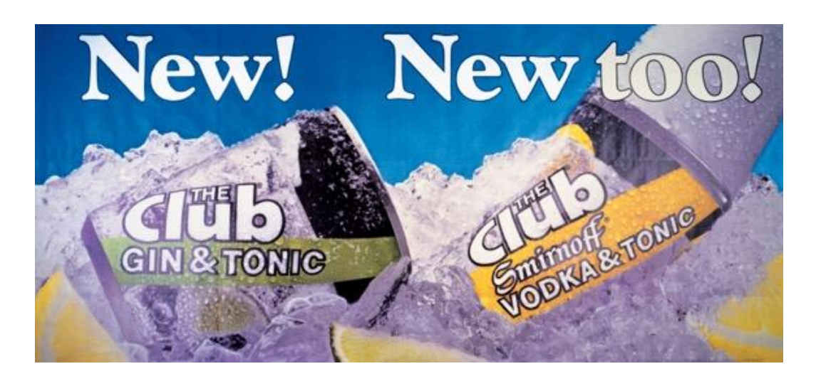
Fig. 2. Jeff Koons, New! New Too! 1983. Lithograph billboard mounted on cotton, 123 x 272 in. Courtesy of Jeff Koons

Artists engaging a product-driven culture populate the exhibition galleries. Dara Birnbaum's Remy/Grand Central: Trains and Boats and Planes (1980), commissioned by the cognac retailer and shown in the New York City terminal, plays in the same gallery as Peter Halley's Pepsi Please (1980) hangs, a painting of a ghoulish figure captioned by the title of the work. General Idea's dollar sign-shaped The Boutique from the 1984 Miss General Idea Pavilion (1980) is overloaded with gift shop-type memorabilia. Walter Robinson's painted still life Lube Landscape (1985), Haim Steinbach's shelf of detergent boxes and ceramic pitchers, supremely black (1985), and David Wojnarowicz's painting on a supermarket poster, USDA Choice Beef (1985) mine the vocabulary of contemporary advertising and product design. Gretchen Bender's Dumping Core (1984) intercuts the logos of television networks and car companies with news footage and clips of the Statue of Liberty across thirteen video monitors to a thrumming synthesizer and percussion soundtrack. Stripping away coded messaging, Jennifer Diamond's T.V. Telepathy (Black and White Version) (1989; courtesy of the artist) fills a gallery wall, directing viewers in bold black lettering to "Eat Sugar" and "Spend Money" (fig. 1).