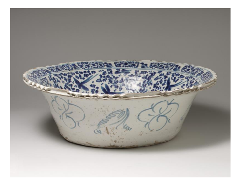
Fig. 1. Attributed to Damián Hernández (Mexican, active 1607–70), Basin, 1660–80. Tin-glazed earthenware made in Puebla, Mexico, h. 6 1/2 in.; d. 20 1/4 in., The Metropolitan Museum of Art; Gift of Mrs. Robert W. de Forest, 1911.

emblematic museums, such as The Metropolitan Museum of Art, at the beginning of the twentieth century for works produced in New Spain, particularly ceramic objects (fig. 1).