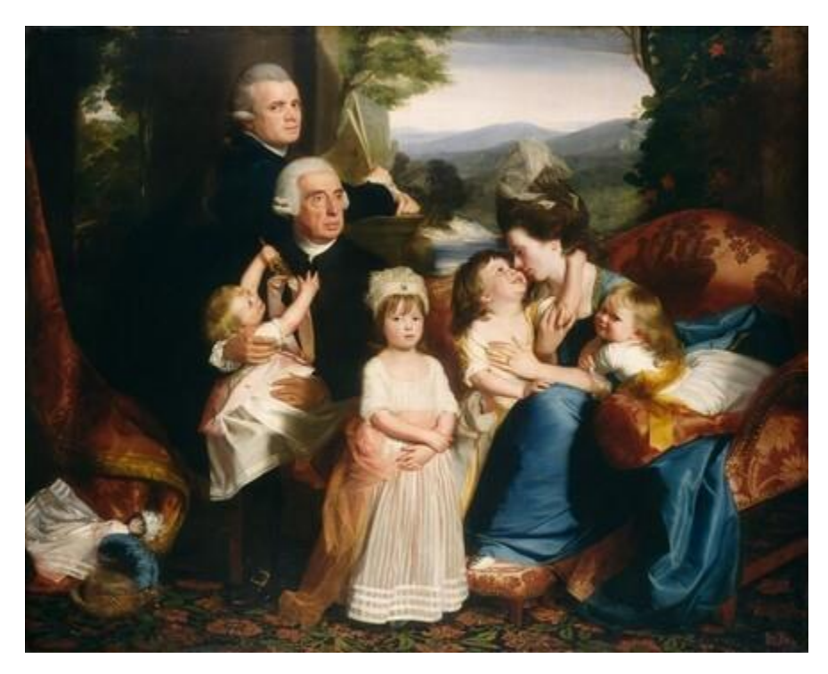
Fig. 1. John Singleton Copley, The Copley Family , 1776–77. Oil on canvas, 72 1/2 x 90 1/4 in. National Gallery of Art, Washington, DC

tarring and feathering. We do, however, know his thoughts on the artistic culture that England, France, and especially Italy had to offer, as Kamensky makes rich use of the correspondence among Copley family members. The creation, survival, and discovery in 1914 of these documents is, of course, a key aspect of this narrative, a rare situation wherein detailed documentary evidence exists, a situation in which proximity often led to silences within the paper trail that lasted for years.