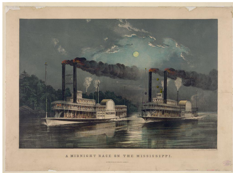
Fig. 3. F. F. Palmer, del.; Currier & Ives, lith., NY, A Midnight Race on the Mississippi , c. 1890. Color lithograph, Library of Congress