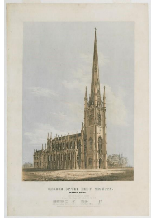
Fig. 4. F. F. Palmer, del.; F. & S. Palmer, lith. NY, Church of the Holy Trinity, Brooklyn Heights . Minard Lafever Archt. 1845. Three-stone lithograph printed in black, tan, and blue. Winterthur Museum, Garden & Library