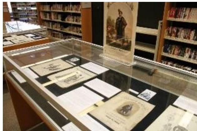
Figs. 2, 3. Left: Installation view of America, Here's My Boy: Mothers of Soldiers in World War I Illustrated Sheet Music , Langsam Library, University of Cincinnati (February 27–April 30, 2017). Right: Installation view of The Wearing of the Green: Irish Identities in American Illustrated Sheet Music, 1840–1925 , Public Library of Cincinnati and Hamilton County (February 10–March 29, 2015)

It was a thrill to work in the archive late on summer evenings, when parking was free downtown. The library was open until nine o'clock at night, and my husband was home to tend to our two sons. I began my work in the mid-1990s before the collection was digitized. The card catalogue was of little use, organized by composer or composition title, with no mention of imagery, illustrator, or theme. Even in digital form, such categories are still not searchable. I went through hundreds of cardboard boxes filled with loose sheet music, much of it marked by dirty hands, and some of it in poor condition. In a spiral notebook, I wrote down song titles and locations. Boxes were organized by year and then alphabetically, such as “1927, A–G,” and there were hodgepodge groupings in bound volumes from private collectors. The only way to discover compelling covers was to look at every piece (over ten thousand of them!), then remember them by taking notes, paying for photocopies, and shooting slides. My strategy was to gather as many images as possible about a given theme