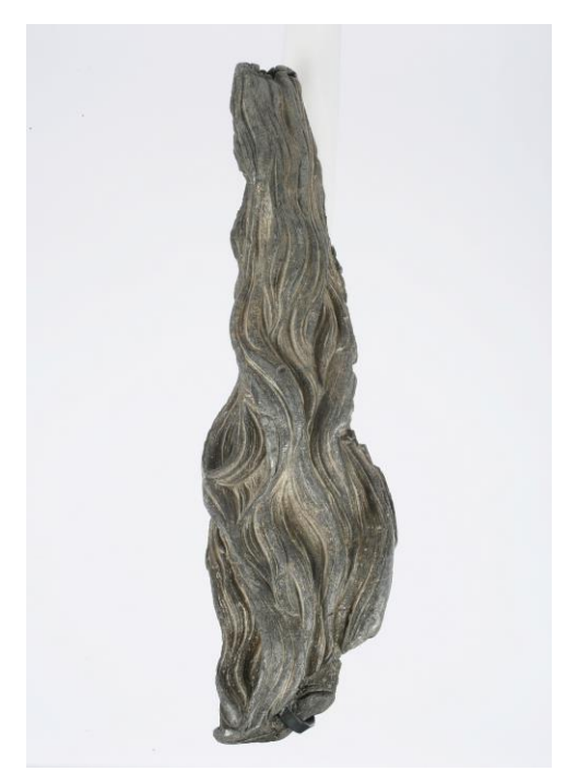
Fig. 1. Joseph Wilton, fragment of the equestrian statue of King George III (tail), 1770. Lead with gilding, 8 1/2 x 19 x 13 in. Purchase, New-York Historical Society, 1878.6.

nation's collective memory. It is in this way that Bellion's text greatly advances the study of public statuary in the United States, supplementing a field that has long been based in the nineteenth and twentieth centuries. The author's contribution to the study of eighteenth-century American sculpture is, however, notable for its absent center: it is an examination of a group of sculptures that are either no longer extant or survive only in fragments (fig. 1).