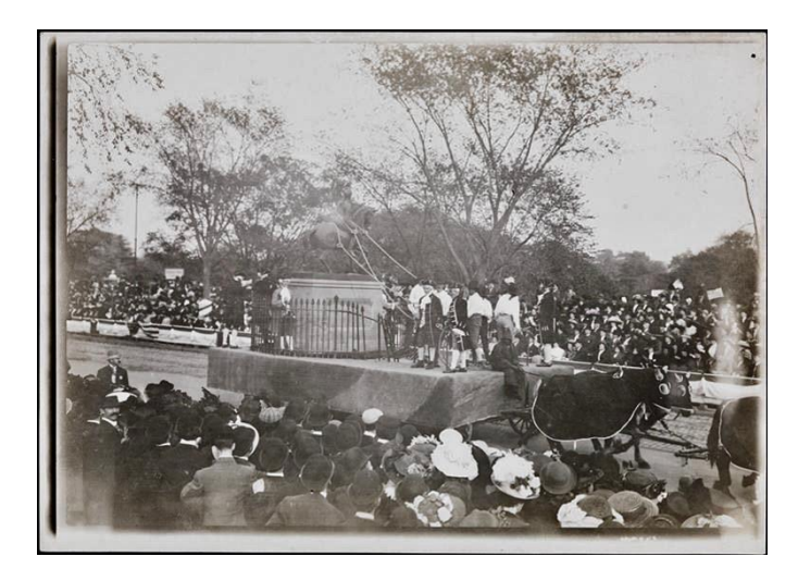
Fig. 5. "Destruction of the Statue of King George III," photograph, 1909.

Karl Marx and Lajos Kossuth), an artist who looked to the revolutionary history of New York City to make sense of his present. By tracing the morphing iconography of Oertel's original image across eight sequential print reproductions of the painting, Bellion links the successive omission of women and people of color from the composition to period anxieties. For example, in prints produced during the wake of the American Civil War, images of a Native American chief, women, children, and African American figures were replaced with an all-white, all-male cast in images offering "an ideal of male brotherhood for a nation wrecked by sectional differences" (155). Bellion ties these instances of pictorial mutation to the Colonial Revival's recoiling defenses of Anglo-American identities before identifying one final stop for the afterlife of King George III: reenactment. A parade float made for New York's 1909 Hudson-Fulton celebration (fig. 5) brought Oertel's two-dimensional picture into the round. Bellion argues that the tableau imagery represented "an icon of British authority" that remained "insistently present on the streets of New York" (166), again reinforcing her argument for the incompleteness of the "revolutionary project."