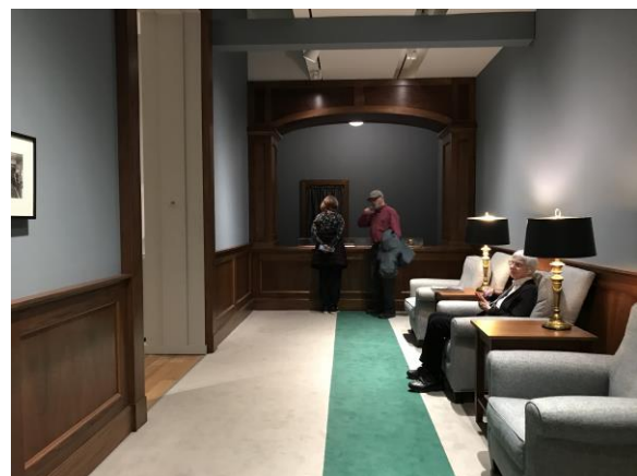
Fig. 2. Installation for gallery with Edward Hopper, Hotel Lobby , 1943. Virginia Museum of Fine Arts, Richmond.

The paradigmatic instantiation of this connection is the exhibition's much buzzed-about gallery-turned-guest room: a physical re-creation of the motel room depicted in Western