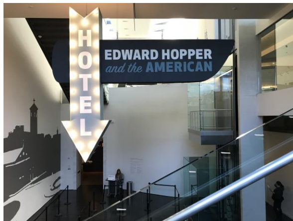
Fig. 1. Entrance to Edward Hopper and the American Hotel . Virginia Museum of Fine Arts, Richmond.

Edward Hopper and the American Hotel is a monographic show that promises, in its titular scope, to be broader than its singular champion. The exhibition, organized by the Virginia Museum of Fine Arts in partnership with the Indianapolis Museum of Art at Newfields, explores the ties between Hopper's work and the industry and built environment of hospitality. As the exhibition makes plain, Hopper, who was a frequent traveler, was deeply familiar with hotels, tourist homes, motels, and other hospitality services, such as luggage assistance and restaurants. Hotels and their dualistic trappings of mobility and rest, and of isolation and community, figure prominently in his work. Hopper's paintings and works on paper generally depict either specific places he saw or imaginary syntheses of such scenes. By leveraging both this hyper-specificity of place and predictable sameness, Hopper's