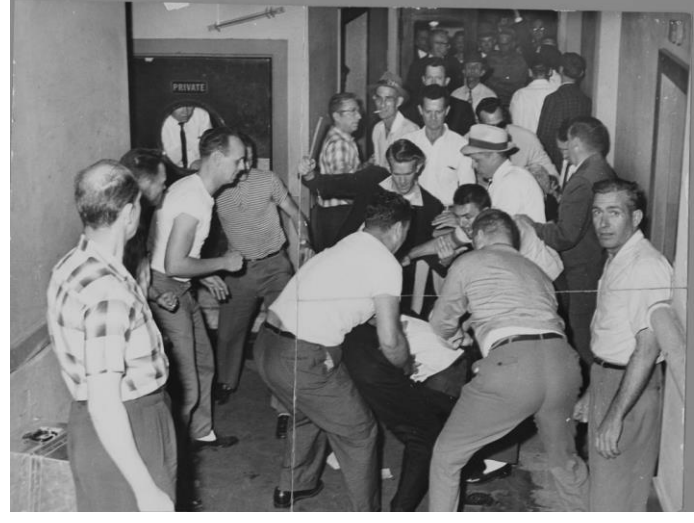
Figs. 1, 2. Left: Fifteen Freedom Riders that arrived on a second bus in Jackson, Mississippi, are loaded into a paddy wagon at the bus station, May 24, 1961. right: Freedom Riders beaten by a mob in Birmingham, Alabama.