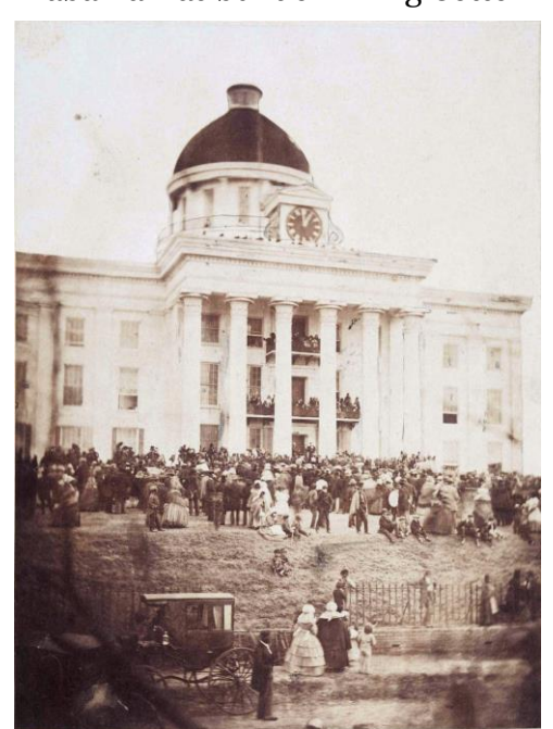
Fig. 6. A. C. McIntyre, "First Inauguration of Jefferson Davis as President of the Confederate States of America at Montgomery, Alabama," 1861.

The Civil War (1861–65) began on February 4, 1861, when Jefferson Davis announced the formation of the Confederate States of America (CSA) from the second-floor balcony of the Alabama State Capitol building. Davis was inaugurated as CSA president two weeks later on the capitol building steps (fig. 6). Montgomery was the first capital of the Confederacy before it moved to Richmond, Virginia, in early March. While the state saw its only serious wartime action in Mobile, it was a central economic engine for the Confederacy. Indeed, Alabama was built on "King Cotton" and the associated wealth and history is tied to the