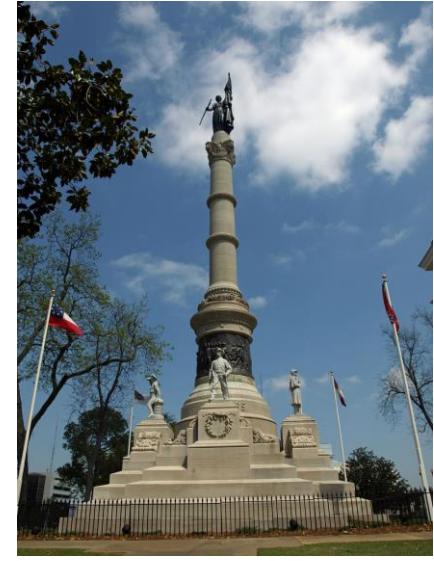
Fig. 4. The Alabama Confederate Memorial Monument, designed by Gorda C. Doud, executed by Alexander Doyle, and erected in 1886, Montgomery, AL.

and upholds the Lost Cause ideology.4 Coined in 1866, the Lost Cause is a form of historical revisionism and signifies a pervasive belief system that glorifies the antebellum South and mythologizes Confederate values. 5 Followers of the Lost Cause forward the especially pernicious idea that the Civil War was fought over states' rights and not slavery; it is an assertion that dangerously undermines the links between slavery and white supremacy, contemporary racism, and neo-confederacy.6 In 2007, vandals made those links explicitly clear when they painted the faces and hands of Confederate soldier statues black on the Alabama Confederate Memorial Monument (fig. 3).7 The 88-foot-tall monument (fig. 4) sits to the north of the State Capitol Building and was erected in 1886 to commemorate the state's 122,000 Confederate veterans.8 A few blocks away, the Civil Rights Memorial (fig. 5), created by Maya Lin (b. 1959) and erected by the Southern Poverty Law Center in 1989, records important dates in the struggle for civil rights. The American Civil War and the Civil Rights Movement are, of course, themselves deeply intertwined—the roots of one fomenting the struggles of the other—and Montgomery occupies a central position within both histories.