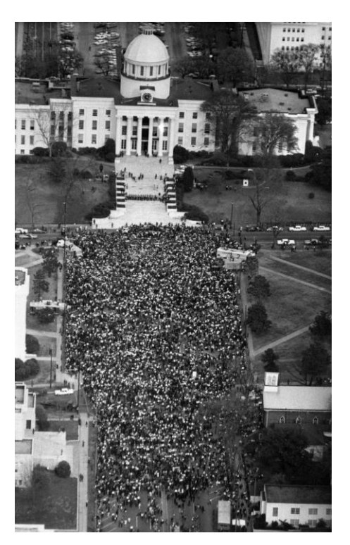
Fig. 7. "March 25, 1965, civil rights marchers form a crowd in front of the Alabama State Capitol in Montgomery, Ala. at the end of their five-day march from Selma, Ala. to protest discrimination against African-Americans in the state's voting practices. A line of guards stretches across the Capitol steps, upper center, but no attempt was made by marchers to enter the Capitol."