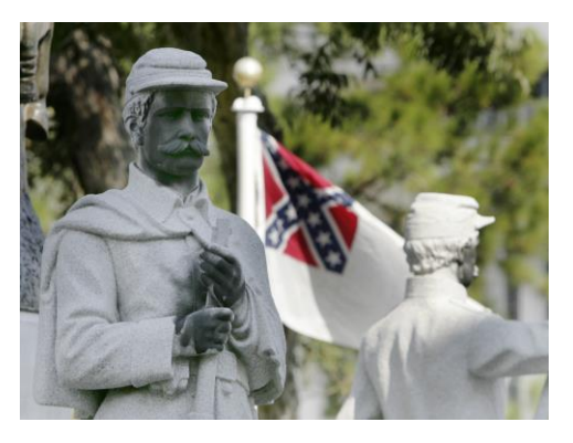
Fig. 3. Black paint covers the face and hands of a statue that was defaced at the Confederate Memorial in Montgomery, AL, 2007.

As an outsider—someone not from the South—I am continually confounded by the regional idiosyncrasies. Alabama, like much of the region, is a place of contradictions. The city seal of the state capital, Montgomery, is "Birthplace of the Civil Rights Movement, Cradle of the Confederacy"; these seemingly incongruous historical moments define the broader regional divisions of the South. The cultural landscape of the city illustrates its opposing histories. Indeed, these two poles are epitomized by dueling tourism sites: the progressive National Memorial for Peace and Justice (fig. 1), alternately known as the National Lynching Memorial, erected by the Equal Justice Initiative in 2018, and the First White House of the Confederacy (fig. 2), which is maintained by the