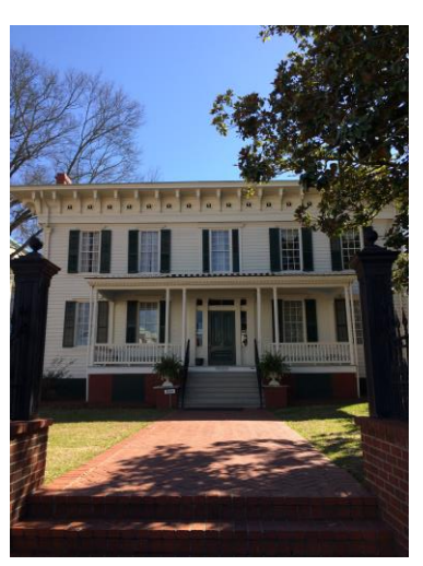
Figs. 1, 2. Left: National Memorial for Peace and Justice, alternately known as the National Lynching Memorial, Montgomery, AL, erected by the Equal Justice Initiative in 2018. Photograph courtesy of the author; right: The First White House of the Confederacy, Montgomery, AL. Photograph courtesy of the author