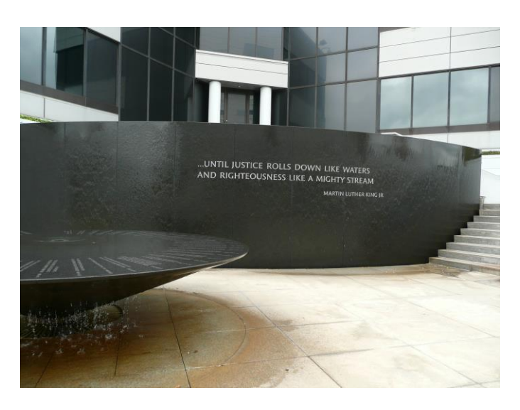
Fig. 5. The Civil Rights Memorial, designed by Maya Lin and erected in 1989, Montgomery, AL.

The Civil War (1861–65) began on February 4, 1861, when Jefferson Davis announced the formation of the Confederate States of America (CSA) from the second-floor balcony of the Alabama State Capitol building. Davis was inaugurated as CSA president two weeks later on the capitol building steps (fig. 6). Montgomery was the first capital of the Confederacy before it moved to Richmond, Virginia, in early March. While the state saw its only serious wartime action in Mobile, it was a central economic engine for the Confederacy. Indeed, Alabama was built on "King Cotton" and the associated wealth and history is tied to the