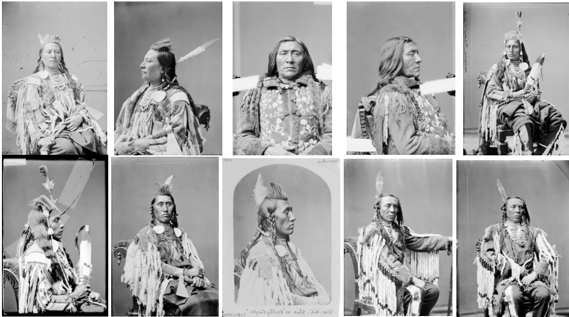
Figs. 2–11. Top row, left to right: Alaxchiiaahush ( Plenty Coups ); Alaxchiiaahush ( Plenty Coups ); Bia Éélisaash ( Two Belly ); Bia Éélisaash ( Two Belly ); Peelatchiwaaxpáash ( Medicine Crow [Raven] ). Bottom row, left to right: Peelatchiwaaxpáash ( Medicine Crow [Raven] ); Déaxitchish ( Pretty Eagle ); Déaxitchish ( Pretty Eagle ); Peelatchixaaliash ( Old Crow [Raven] ); Peelatchixaaliash ( Old Crow [Raven] ). All images, Charles Milton Bell, 1880. Albumen silver print from glass negative, 5 x 7 in. National Anthropological Archives, Smithsonian Institution

these negatives were reprinted, reproduced, and disseminated widely—as cabinet cards for commercial sale, as illustrations in the popular press, as vintage prints for public and private collections, and as advertisements. The widespread circulation of these images often led to the loss of vital information about the sitters’ identities and the circumstances that brought them to the photographer’s studio. “These pictures quickly lost their capacity to narrate specific stories,” Sandweiss writes. “As unidentified portraits in an attic or unlabeled pictures in a flea market stall, they are now simply portraits of strangers, pictures that can evoke much, but tell little . . . full of information and time-bound stories beyond all recovering.” 11