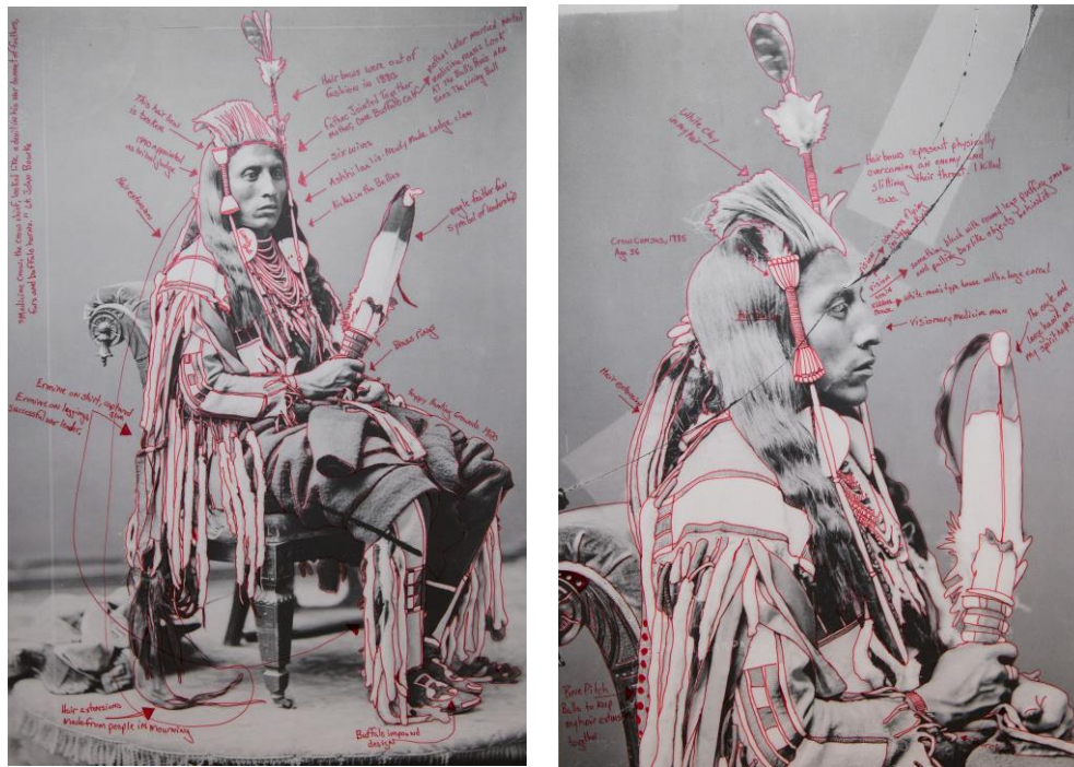
Figs. 31, 32. Wendy Red Star, Peelatchiwaaxpáash/Medicine Crow (Raven) from 1880 Crow Peace Delegation series, 2014. Inkjet print of artist-manipulated digitally reproduced photograph, 24 x 16 7/16 in.

enemy camp; touching an enemy in battle; and leading a successful war party. To examine these symbols in greater detail, let us return to the portrait of Peelatchiwaaxpáash, whose chance encounter with Red Star inspired her to research the photograph and led to the 1880 Crow Peace Delegation series. In contrast to Bell’s photographs (see figs. 6–7), Red Star’s annotated works (see figs. 31–32) bring Peelatchiwaaxpáash’s accomplishments and individuality to the fore, demonstrating how delegation portraiture can and should be re-read. Through her detailed analysis of his attire, his attainment of the four coups can be registered: the ermine on his shirt indicates that he stole a weapon, captured a horse from within an enemy camp, and was the first to touch an enemy in battle, while the ermine on his leggings signifies that he led a successful war party. The conch shells, dentalium hair bows, and shell disc loop necklace are representative signs of a trade system that predated colonization. Although one of the bows is broken and missing its feathered attachment, he wears it assuredly, providing a glimpse of his confident personality. Moreover, the incorporation of European embellishments, such as the brass shoe buttons on the last row of his loop necklace, reflect the aesthetic ingenuity of the maker.