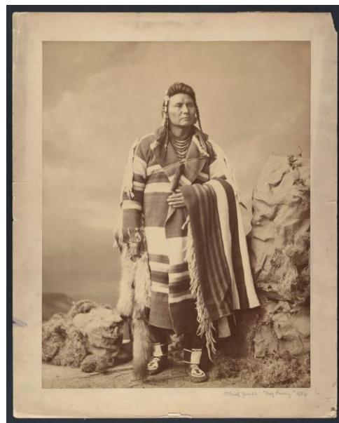
Fig. 21. Charles Milton Bell, Hinmatóowyalahtq’it (Chief Joseph), 1879. Albumen silver print from glass negative, 17 1/8 × 13 1/4 in. The Metropolitan Museum of Art, New York, Gilman Collection, Museum Purchase, 2005.100.656

to be simple portrait busts, often framed head-on and in profile against an empty backdrop. This practice was informed by the then-popular but now discredited fields of phrenology and physiognomy, which incorrectly believed that detailed views and measurements of one’s head or face could provide scientists with the information necessary to assess the character of an individual. In contrast, Bell’s commercial portraits, which he often sold as collectible cabinet cards, were shot in elaborate settings, as seen in his portrait of Hinmatóowyalahtq’it (Chief Joseph) (fig. 21), who was photographed standing in an artificial landscape composed of a papier-mâché rock, faux moss, and a painted backdrop. 51