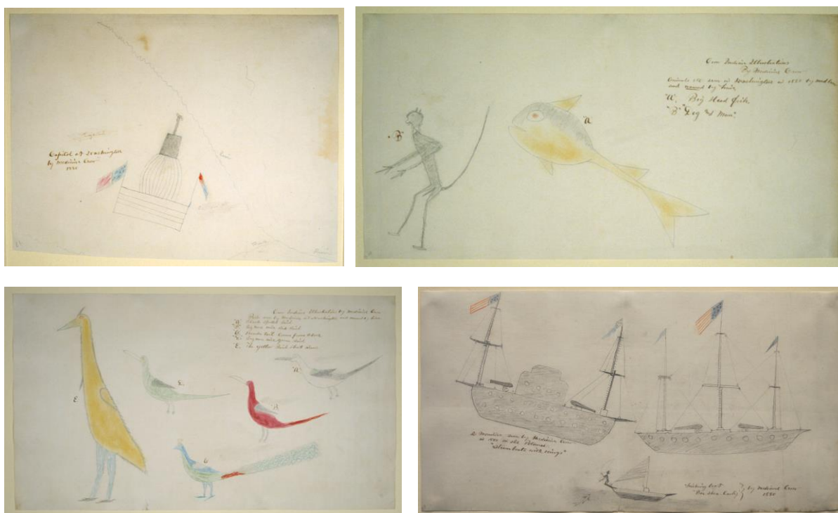
Figs 17–20. Peelatchiwaaxpáash (Medicine Crow [Raven]). Top row, left to right: Capitol at Washington , 1880. Graphite, colored pencil, and ink on paper, 10 x 13 1/8 in.; Big Head Fish and Dog and Man , 1880. Graphite, colored pencil, and ink on paper, 9 2/3 x 10 3/4 in. Bottom row, left to right: Black Spotted Bird , Big Nose Nice Red Bird , Wonder Tail Comes from Above , Big Nose Nice Green Bird , and The Yellow Bird that Runs , 1880. Graphite, colored pencil, and ink on paper, 11 1/3 x 20 in.; “ Steamboats with Wings ” or Two Monitors on the Potomac River and “ Bar shea carty ” or Fishing Boat , 1880. Graphite, colored pencil, and ink on paper, 9 1/8 x 17 1/3 in.. Charles H. Barstow Collection, Special Collections, Montana State University Billings Library, 1930.17, .25, .22, and .19

visual documentation of his time in Washington, DC. In his depiction of the Capitol Building (fig. 17), he included two flags and a dome topped with a figure wearing an eagle-feathered helmet—a depiction of Thomas Crawford’s Statue of Freedom (1863; Capitol Building Dome, Washington, DC) . He also vividly recalled several animals from the circus, which he sketched and named, including “big head fish” and “dog and man” (or monkey) (fig. 18), as well as a number of different birds, notably “Wonder Tail Comes from Above” (or peacock) (fig. 19). 49 Taken by the various boats he saw on the Potomac, he recorded two military monitors with flags and cannons, as well as a small fishing boat, perhaps added for scale (fig. 20). Together these drawings provide a glimpse into the experiences and impressions of Peelatchiwaaxpáash, who used graphite and colored pencil to memorialize the trip, thus providing a visual counternarrative to the account set forth in government documents, newspaper articles, and portrait photographs made by non-Native artists.