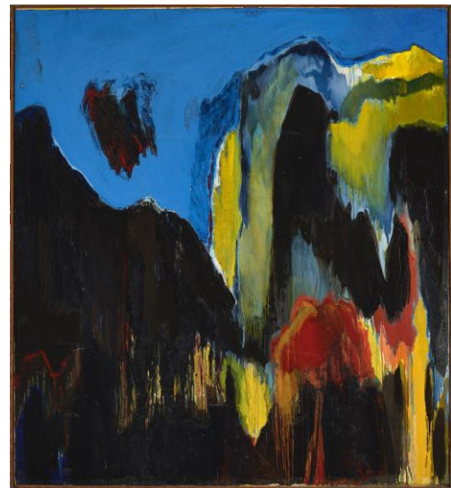
Fig. 2. Bernice Bing, Blue Mountain No. 4 , c. 1965. Oil and acrylic on canvas, 75 x 68 1/8 in. Cantor Arts Center, Gift of Alexa Young,

Private collections and artists’ families hold a significant concentration, if not the majority of, Asian American art in the United States. There are undoubtedly valid critiques to be made regarding the politics and ramifications of Brown, a white art dealer, accumulating a collection of work by nonwhite artists. This paradigm, however, is common in the art world and should be of no surprise, given the concentration of wealth in the United States. However racially and economically problematic, through his persistent collecting done in collaboration with many artists’ families, Michael Donald Brown surely saved a meaningful number of artworks from certain obscurity—although as a private collector, he was not obligated to make his collection accessible to researchers or the public, he ultimately did so.