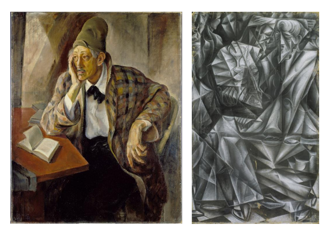
Figs. 4, 5. Left: Ejnar Hansen, Portrait of Sadakichi Hartmann , before 1934. Oil on canvas, 51 1/8 \ge 41 \le 1/8 in. Los Angeles County Museum of Art; digital image © 2021 Museum Associates / LACMA. Licensed by Art Resource, NY; right: Ben Berlin, Portrait of Sadakichi Hartmann , 1934. Pastel on brown fiberboard, 61 3/8 \ge 31 \le 5/8 in. The Phillips Collection, Washington, DC

Mintz Messinger, former Associate Curator of Modern and Contemporary Art at the Metropolitan Museum of Art, attributed artistic interest in Hartmann to his personality.<sup>56</sup> Some (though not all) of these images betray an unsavory racial fascination at best, or racial caricature at worst (see, for example, fig. 7). But the sheer number of representations of Hartmann make his presence in American art undeniable.