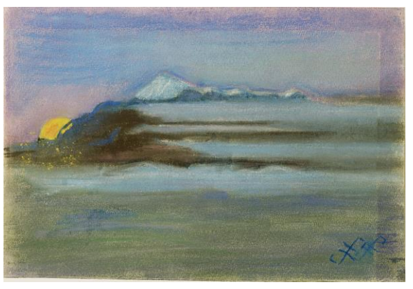
Fig. 8. Sadakichi Hartmann, Moonrise San Jacinto. A Japanese Print , c. 1923–1944. Pastel on paper, 77/8 x 115/8 in. The Phillips Collection, Washington, DC

Hartmann's pastel Moonrise San Jacinto . A Japanese Print depicts the California landscape of his home in the San Gorgonio pass (fig. 8). In the jewel-like landscape, striations of blue, green, and dark brown foreground a pink sky and the moonrise of the title. It is emblematic of his philosophy that American artists should depict their local surroundings. In a poem accompanying the pastel, Hartmann implores: "Why stray to foreign lands when you have at your door a garden that crept out of arid sands and yon mountain there—marvel of volcanic art: San Jacinto's dauntless soar, a white pyramid two miles above the desert's floor, vast, serene,