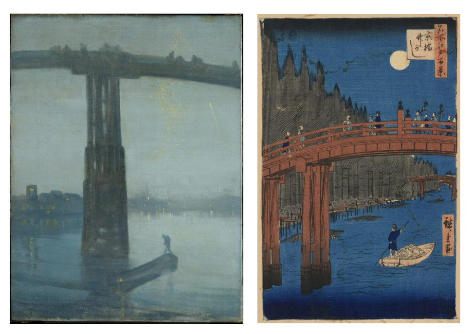
Figs. 10, 11. Left: James Abbott McNeill Whistler, Nocturne: Blue and Gold—Old Battersea Bridge , c. 1872–75. Oil on canvas, 26 7/8 x 20 1/4 in. Tate, Presented by the Art Fund 1905; Photo © Tate; right: Hiroshige Andō, Bamboo Yards, Kyobashi , 1857. Color woodcut print, 13 1/4 x 8 1/2 in. Library of Congress

While Hartmann does not identify the exact print, he was probably thinking of Hiroshige's Bamboo Yards, Kyobashi (fig. 11). He mentions that Hiroshige prints are visible in other Whistler paintings and that Whistler is better than the average artist who follows "the Eastern trail of art."<sup>70</sup>