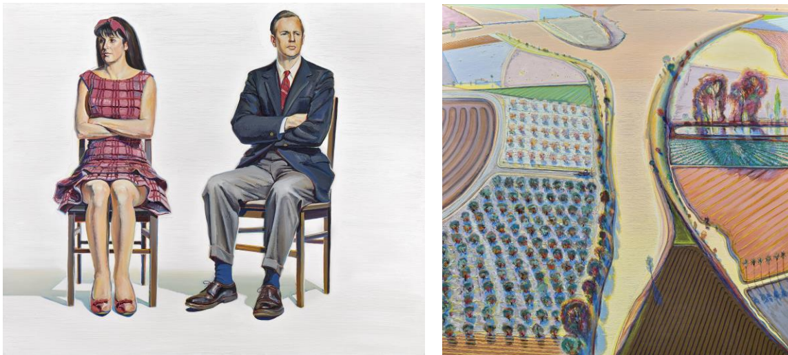
Figs. 3, 4. Left: Wayne Thiebaud, Two Seated Figures , 1965. Oil on canvas, 60 x 72 in. Right: Wayne Thiebaud, Y River , 1998. Oil on canvas, 72 x 72 in. Both images: Courtesy of the Wayne Thiebaud Foundation. Photo: © Wayne Thiebaud / Licensed by VAGA at Artists Rights Society (ARS), NY

as objectified as the generic desserts in his still lifes. For Two Seated Figures (1965; fig. 3), a favorite with exhibition visitors, the artist's wife and a friend posed anonymously. Life-size, the pair sit in straight wooden chairs against a flat off-white background with no illusory space behind the chairs, which puts them in the viewers' room. Arms folded, they refuse eye contact with each other and the viewer. The sitters are performing parts, but the central role is the viewer's. Since the two figures are in our space but ignore us, we can stare at them, invent a narrative, or study their shoes; we can pay them the kind of attention we give strangers in airports. Betty Jean Thiebaud and Book (1965–69), mounted nearby, is a portrait of the artist's wife in which she appears as objectified as she is in Two Seated Figures . These works inspire existentialist interpretations.