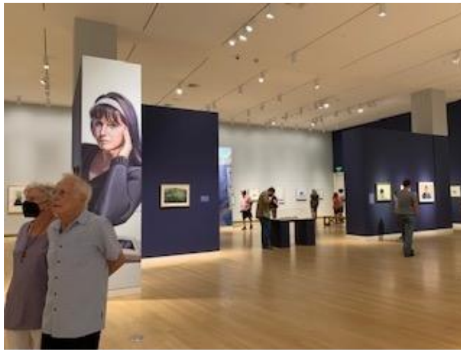
Fig. 1. Installation view of Wayne Thiebaud: Celebrations, 1920–2021, at the Crocker Art Museum in Sacramento, May 29, 2022–August 7, 2022.