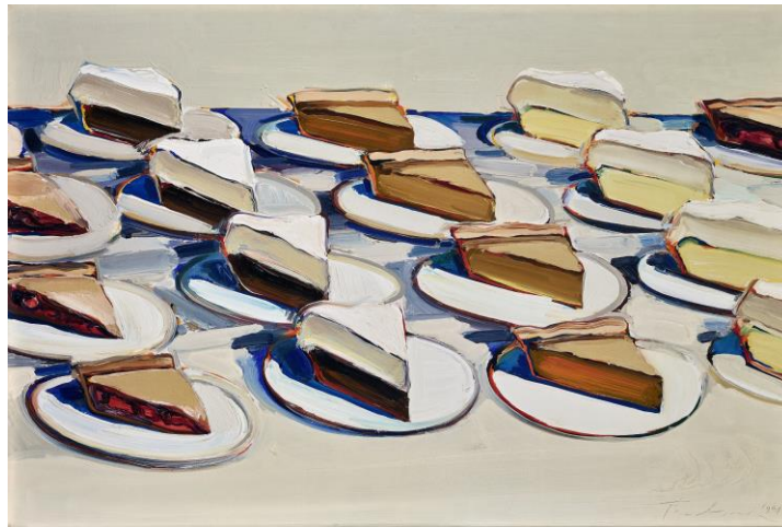
Fig. 2. Wayne Thiebaud, Pies, Pies, Pies , 1961. Oil on canvas, 20 x 30 in. Crocker Art Museum, gift of Philip L. Ehlert in memory of Dorothy Evelyn Ehlert, 1974.12. Photo: © Wayne Thiebaud / Licensed by VAGA at Artists Rights Society (ARS), NY

Nearby are four 1961 breakthrough paintings: Cold Cereal , Hamburger , Four Prone Figures , and Pies, Pies, Pies (fig. 2). The difference is dramatic. These early mature works are trademark Thiebaud: bright, colorful, realistic images that “tattle” on how middle Americans lived their daily lives in a well-lit world of convenience food and leisure time. With lavish care and skill, Thiebaud gave the barely noticed things of his world the charisma of movie stars, staging them carefully and visually tipping their performances into the viewer’s space. Food, primarily desserts in retail displays, is the subject of most of the still lifes in the exhibition, as in the artist’s oeuvre. Sheets of thumbnail drawings and prints in the show, like the twelve small still-life intaglio prints in the Delights series, offer insight into Thiebaud’s visual thought process.