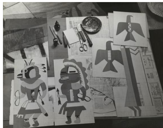
Fig. 6, 7. Left: Ernest Naquayouma with preparatory works for US Pavilion murals, 1937. Wiener Collection (Bx 155), box 8, folder 6. Photo: KNOPF-PIX; right: Preparatory work for US Pavilion murals, 1937. Wiener Collection (Bx 155), box 8, folder 6. Photo: KNOPF-PIX

There is much to unpack in this highly staged image, particularly when it is placed in dialogue with a second photograph from the press kit (fig. 7). This print shows an array of designs on what is described on the verso as “the working table of Buk Ulrich.” Yet this photograph records the same desk at which Naquayouma posed in the previous photograph. The placement of ink, brushes, scissors, knives, and palette are identical; only the bowl and man have been removed. Moreover, although the photograph’s caption and the newsprint covering the table surface suggest an active working space, these designs have progressed past the point of loose inspiration. In the lower right, a painting of an elongated figure has been sliced along its left side, ready to be collaged into a larger composition. Rectangular