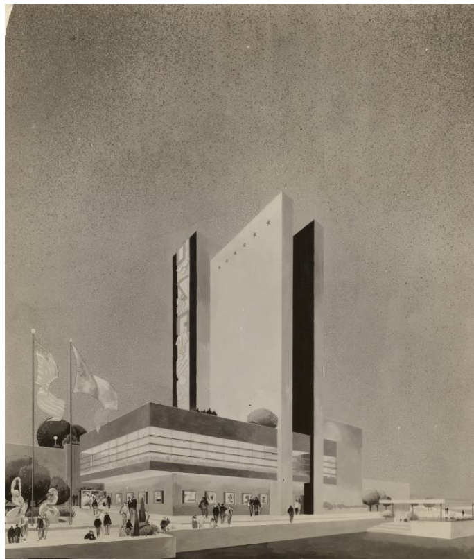
Fig. 5. Artist unknown, Proposed sketch for US Pavilion. Wiener Collection (Bx 155), box 18, folder 8