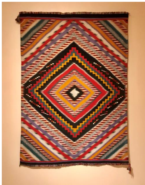
Fig. 2. Diné artist, Germantown blanket (eye-dazzler), c. 1900. Wool yarn, cotton warp, and cotton string, tapestry weave, 56 3/4 x 39 3/4 in. Division of Anthropology, American Museum of Natural History, New York, Collected by Uriah S. Hollister, c. 1911

The physical exhibition of Shaped by the Loom continued on the gallery's second floor, with the next section, "Ecology," coming into view at the stairway landing. Three large nineteenth-century weavings from the American Museum of Natural History were hung side by side, drawing the viewer in with their size and symmetrical patterning. On the wall opposite, text explained the significance of the weaving process—which includes sheepherding, wool processing, and plant harvesting for natural dyes—and the ways this process arises from the transmission of generations of cultural knowledge gleaned from and connected to the local landscape. The process was further illuminated by the inclusion of sheepskin, wool samples, and historic and contemporary photographs of sheepherding.