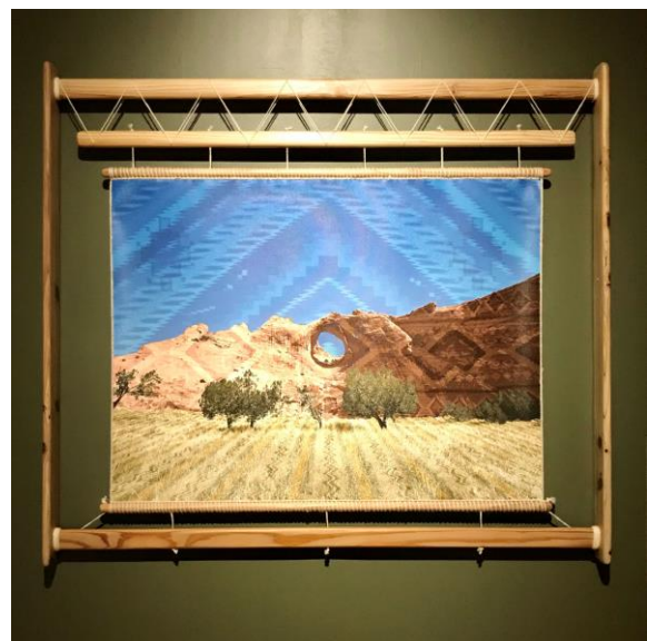
Fig. 1. Darby Raymond-Overstreet, Woven Landscape, Window Rock , 2022. Digital print and wooden loom frame, 36 3/4 x 41 1/2 x 2 1/2 in. (including loom frame).

The decision to introduce the show with Raymond-Overstreet's work and words reflects curator Hadley Welch Jensen's investment in emphasizing the continuing aesthetic customs of Diné makers, collaborating with and promoting the voices of Indigenous artists and other community members, emphasizing the place-based worldviews that Diné aesthetics are informed by, and presenting contemporary artwork of multiple media alongside historic textiles.