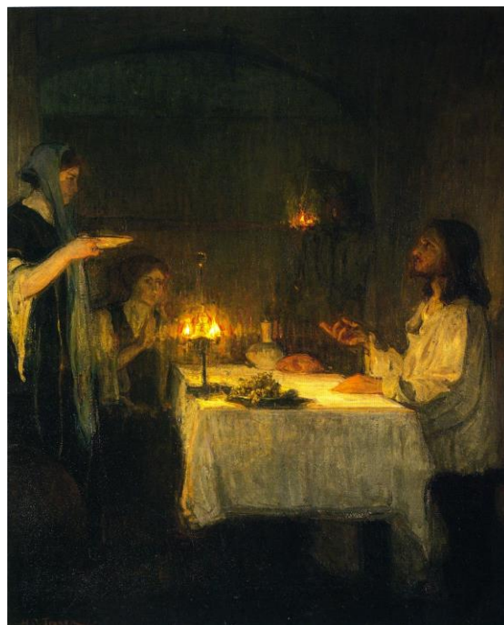
Fig. 1. Henry Ossawa Tanner, Christ at the Home of Martha and Mary , c. 1905. Oil on canvas, 51 1/2 x 41 1/2 in. Carnegie Museum of Art, Pittsburgh, PA