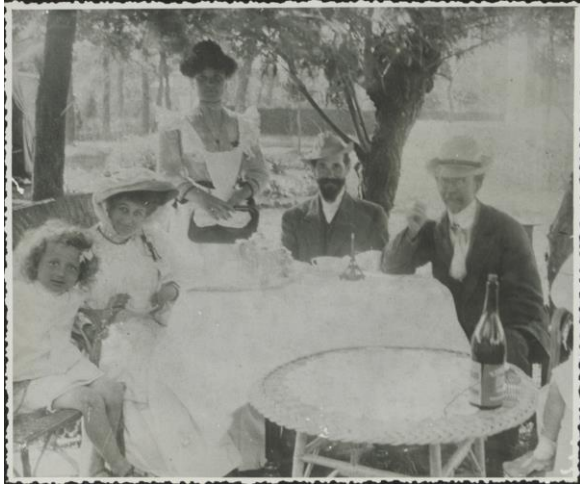
Fig. 5. Henry Ossawa Tanner and family dining outdoors, 1907 or 1908. Black-and-white photographic print.