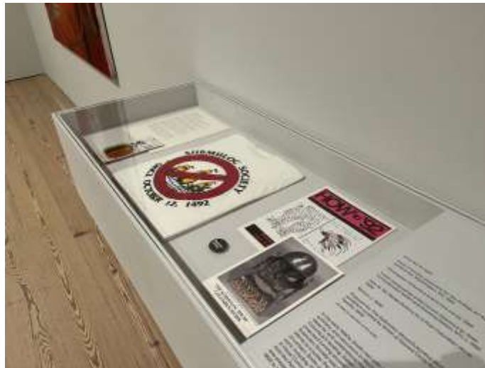
Fig. 3. Installation view of ephemera related to the Submuloc Society Since 1492, collection of Jaune Quick-to-See-Smith. Whitney Museum of American Art, New York.