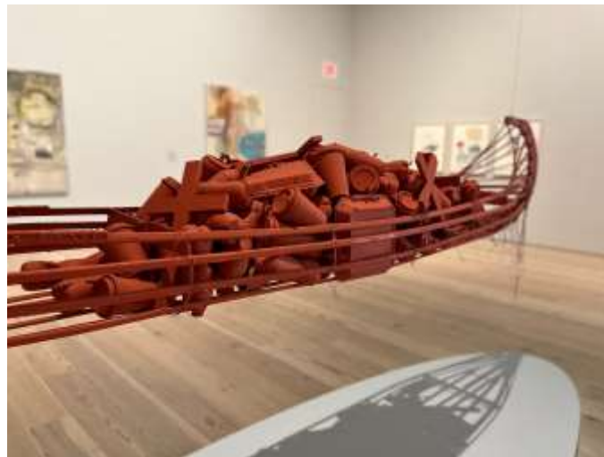
Fig. 5. Gallery view with detail of Jaune Quick-to-See Smith and Neal Ambrose-Smith, Trade Canoe: Making Medicine , 2018. Pinewood lath, plastic water bottles, Styrofoam and paper coffee cups and take-out containers, wooden crosses, hypodermic needles, acrylic, and synthetic sinew, 22 x 132 x 18 in.

orientations, disrupt the viewer’s customary viewpoint in a manner that is both playful and provocative. In a sense, this is Smith playing the role of the trickster, another Indigenous device that persists across her body of work via the figure of Coyote. In Survival Map , the phrase “NDN humor / Causes people / To survive” blends sentiments of humor with trauma in a nuanced manner that artist Jeffrey Gibson (Cherokee and Choctaw) describes as characteristic of Native American humor. 9