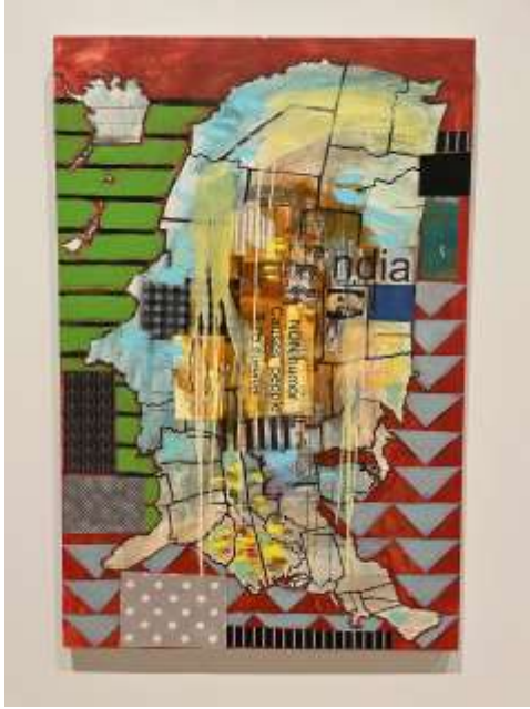
Fig. 4. Jaune Quick-to-See Smith, Survival Map, 2021. Acrylic, ink, charcoal, fabric, and paper on canvas, 60 x 40 in.