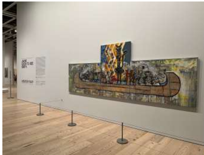
Fig. 1. Introductory wall of Jaune Quick-to-See Smith: Memory Map , featuring Trade Canoe: Forty Days and Forty Nights , 2015. Oil, acrylic, oil crayon, paper, and charcoal on canvas, three panels, 60 x 160 in. Whitney Museum of American Art, New York.

Coyote as a central character with these bright beams behind him.” 3 Smith uses the trade canoe icon as a signifier for confrontation between Indigenous Americans and European colonizers, often filling the canoes with items that are vulnerable to being lost or stolen or that serve as references to the toxic effects of colonization on Native American communities.