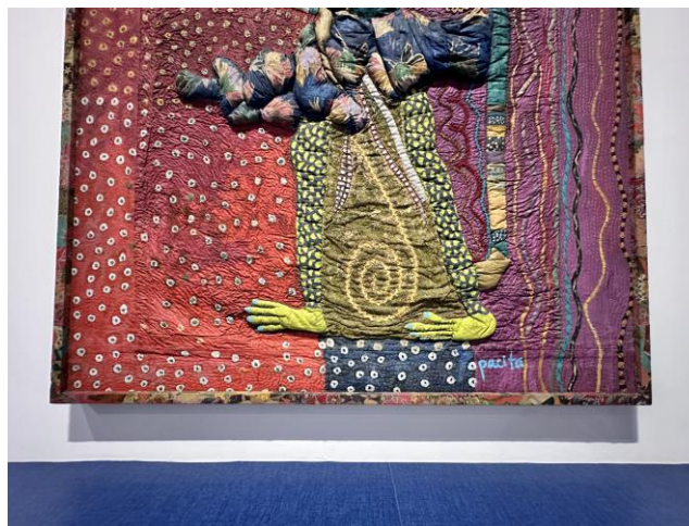
Fig. 2. Pacita Abad, Subali (detail), 1983/90. Acrylic, oil, gold cotton, batik cloth, sequins, rickrack ribbons on stitched and padded canvas, 107 1/2 x 72 1/2 in. Pacita Abad Art Estate.