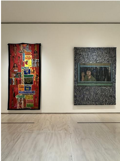
Fig. 3. Left: Pacita Abad, Girls in Ermita , 1983. Acrylic on stitched and padded muslin, 112 x 55 in. Pacita Abad Art Estate; right: Pacita Abad, Caught at the Border , 1991. Acrylic, oil, mirrors, sequins on stitched and padded canvas, 98 x 68 in. Pacita Abad Art Estate.

Abad's stitched trapuntos puncture the veil of oppression—the word trapunto , in fact, derives from the Italian trapungere (to embroider) and the Latin pungere (to prick or puncture)—exposing the radiant and vivacious presence of everything everywhere, all at once. Abad's trapuntos are brilliant in both senses of the word: the surfaces are bright and luminous, sunbursts of color pierced with miniature mirrors, beads, shells, and sequins. They are also clever and intelligent, the products of a relentlessly curious and creative mind committed to visualizing the interconnectedness of colonialism, globalization, gender discrimination, labor rights, and immigration. Abad rendered brilliant surfaces that draw viewers into the works and then keep them looking. While these brilliant trapuntos are beautiful, the subjects themselves disrupt any initial pleasure that comes from pure aesthetic appreciation. This was my experience when viewing Caught at the Border (fig. 3),